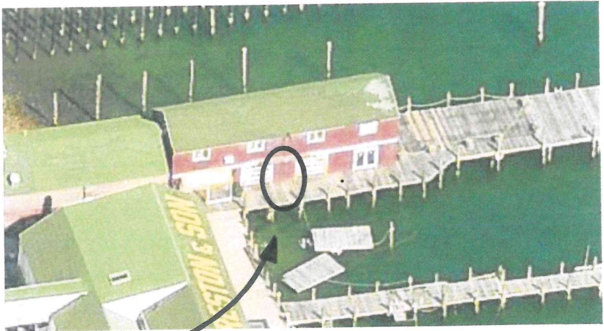
LOCATION OF SIGN