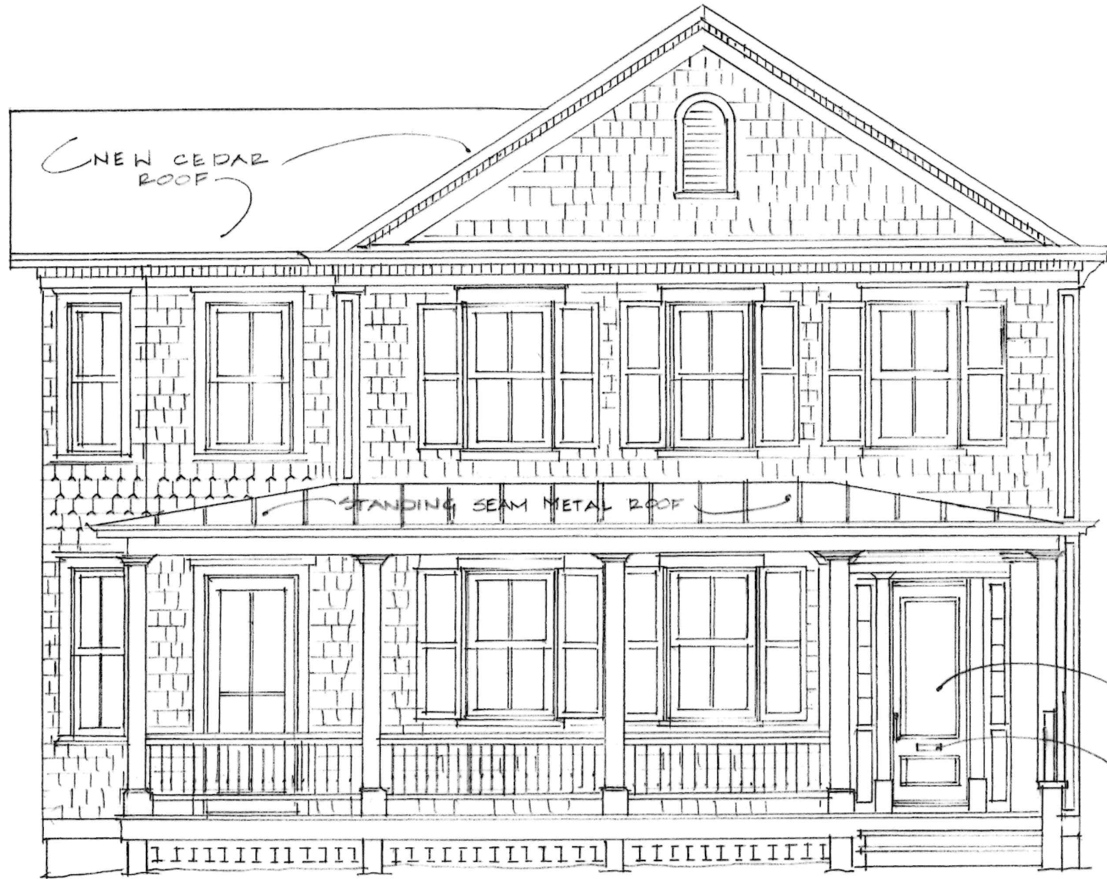
EAST-FRONT ELEVATION - UPDATED

VILLAGE OF GREENPORT BUILDING DEPARTMENT