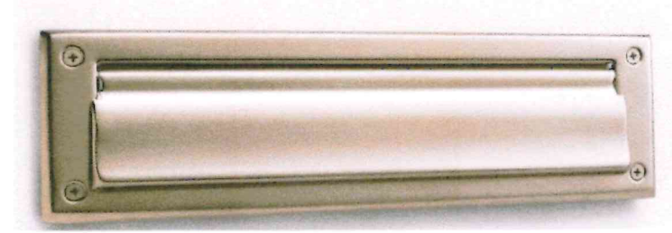
Rejuvenation Large Mail Slot