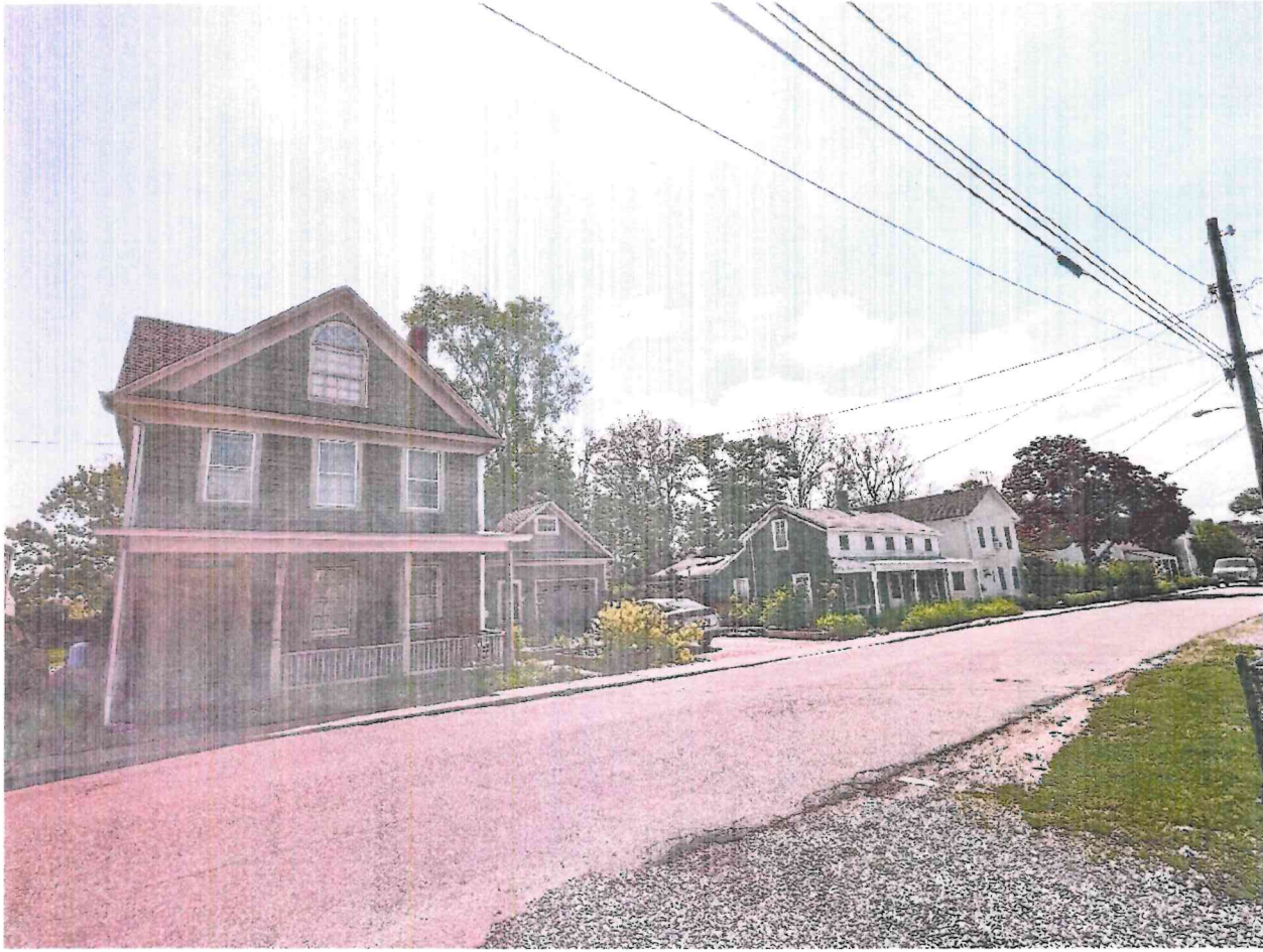
HPC Application of Rivara; 628 Carpenter Street