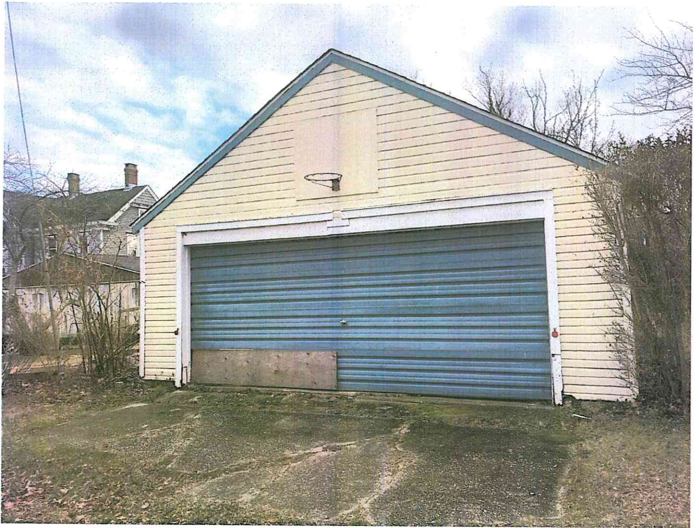
Existing Garage Door Photo Taken 01/24/21 Webb St between First and Second South side of the street