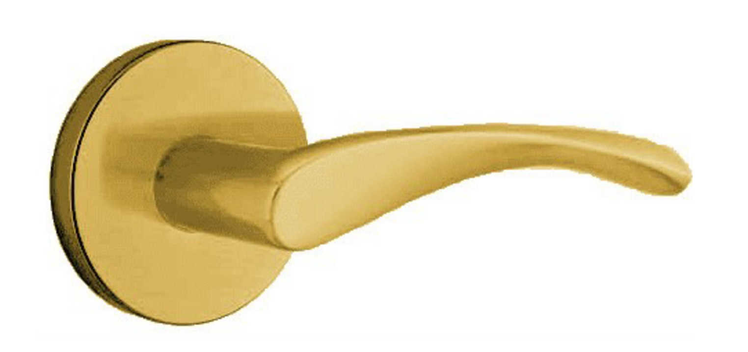
PROPOSED HARDWARE: EMTEK 'TRITON' LEVER (BRASS) WITH ROUND ROSETTE AND ROUND DEADBOLT