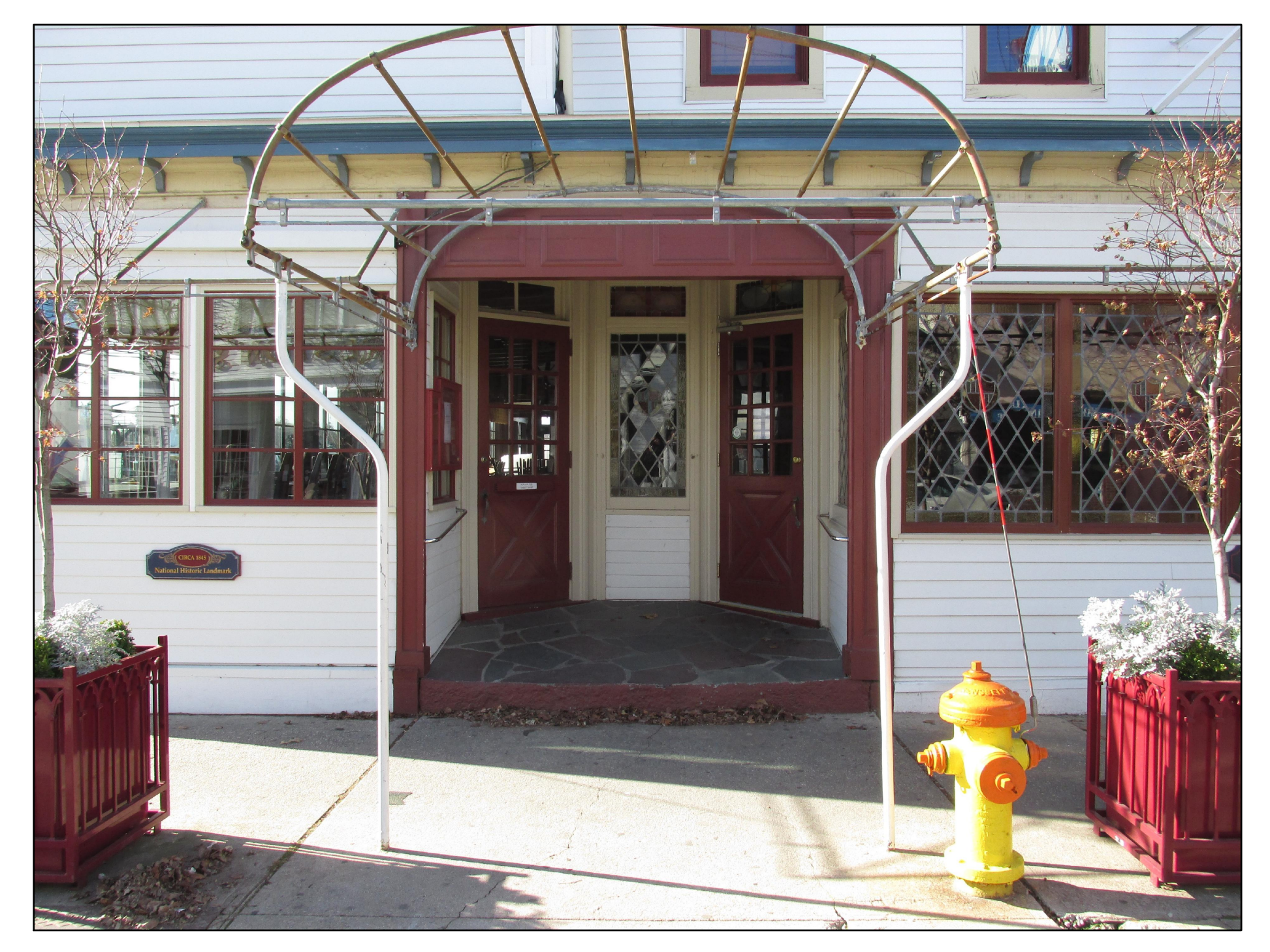
MAIN STREET AWNING