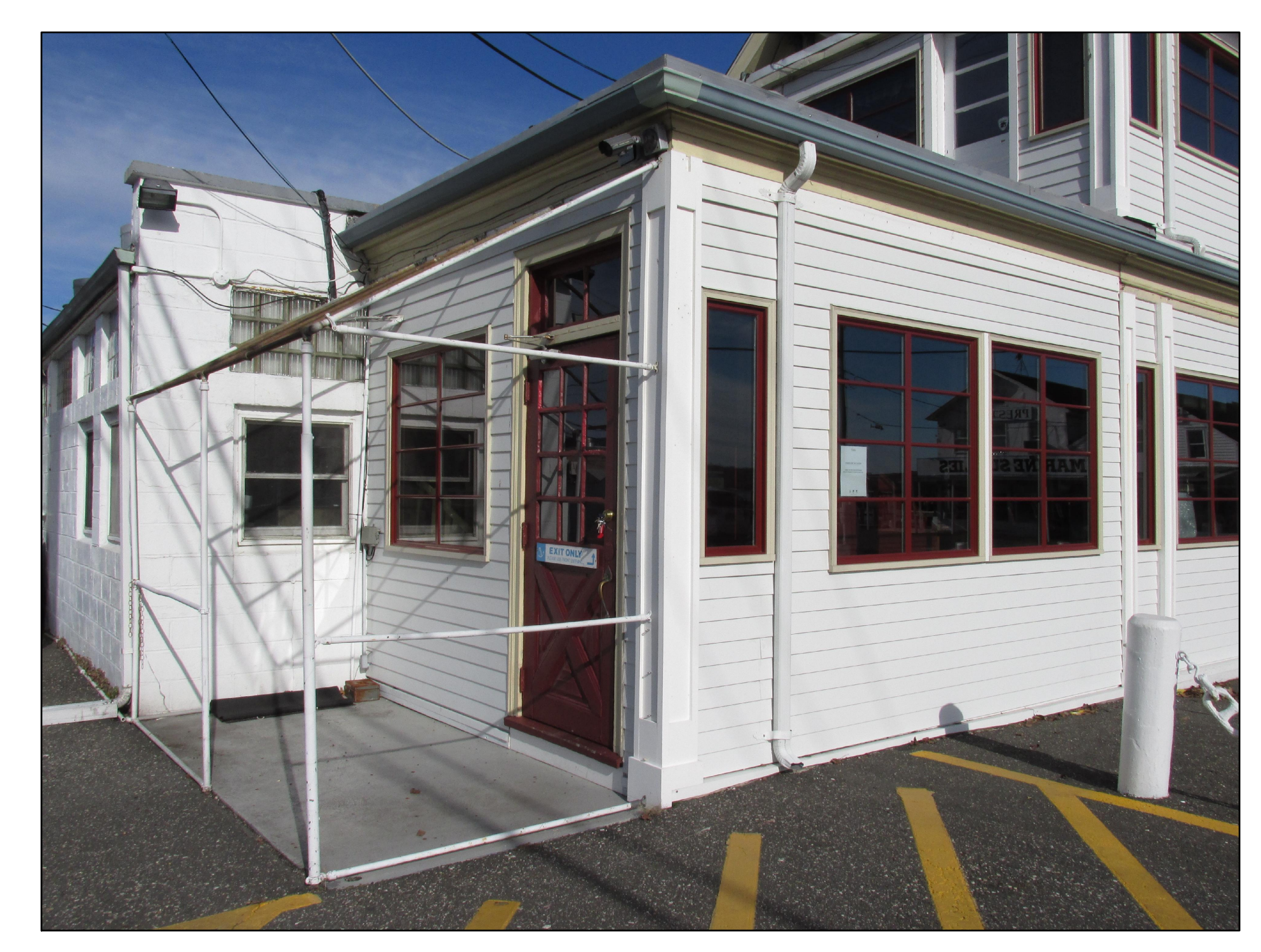
WEST ENTRY AWNING