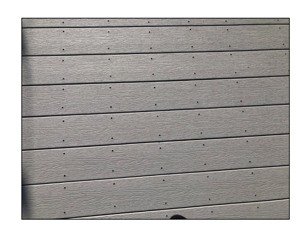
VERANDA DECKING TO MATCH EXISTING AT WHARF (SHOWN)