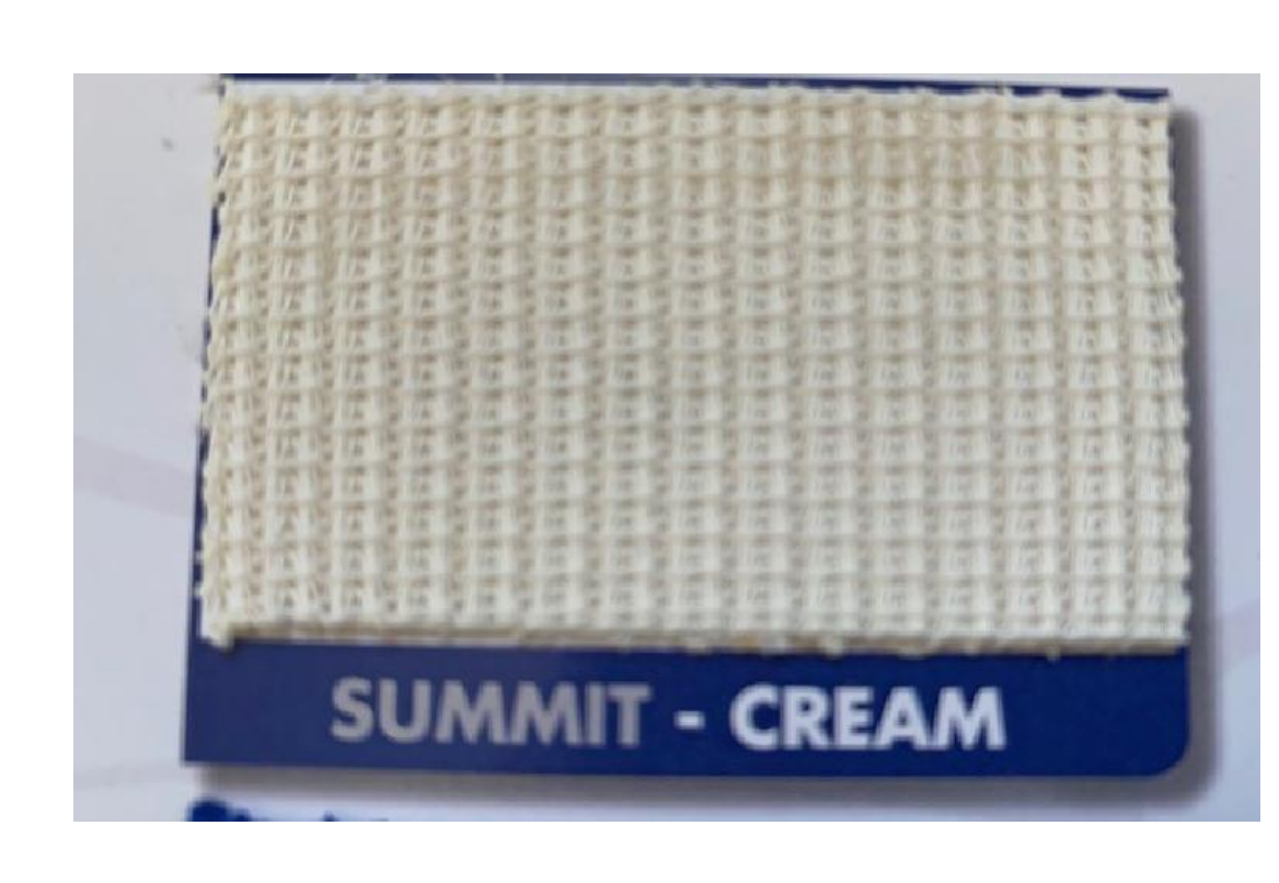
SAIL AWNING FABRIC