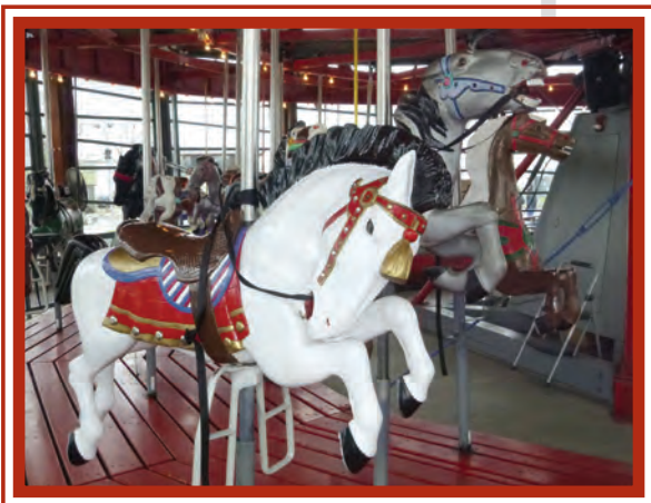
THREE HANDCARVED HORSES

We ask you to be careful of our antique ride and its hand carved horses.